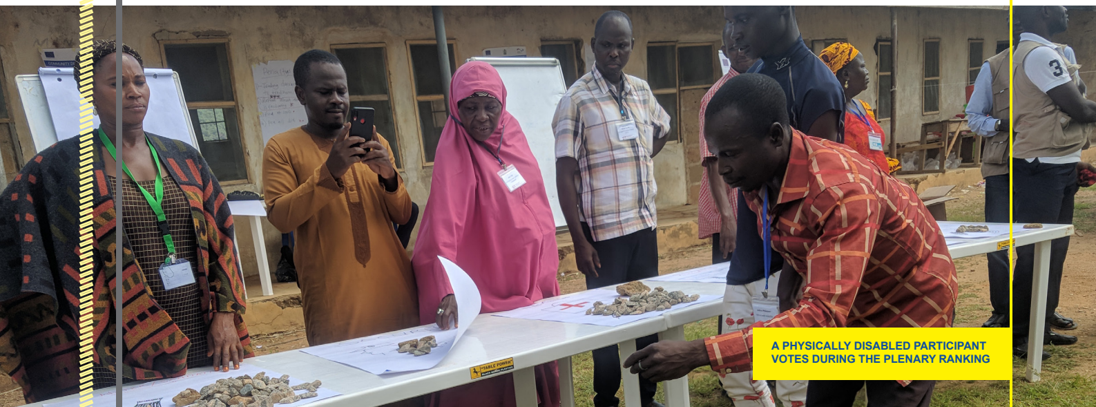
A PHYSICALLY DISABLED PARTICIPANT VOTES DURING THE PLENARY RANKING