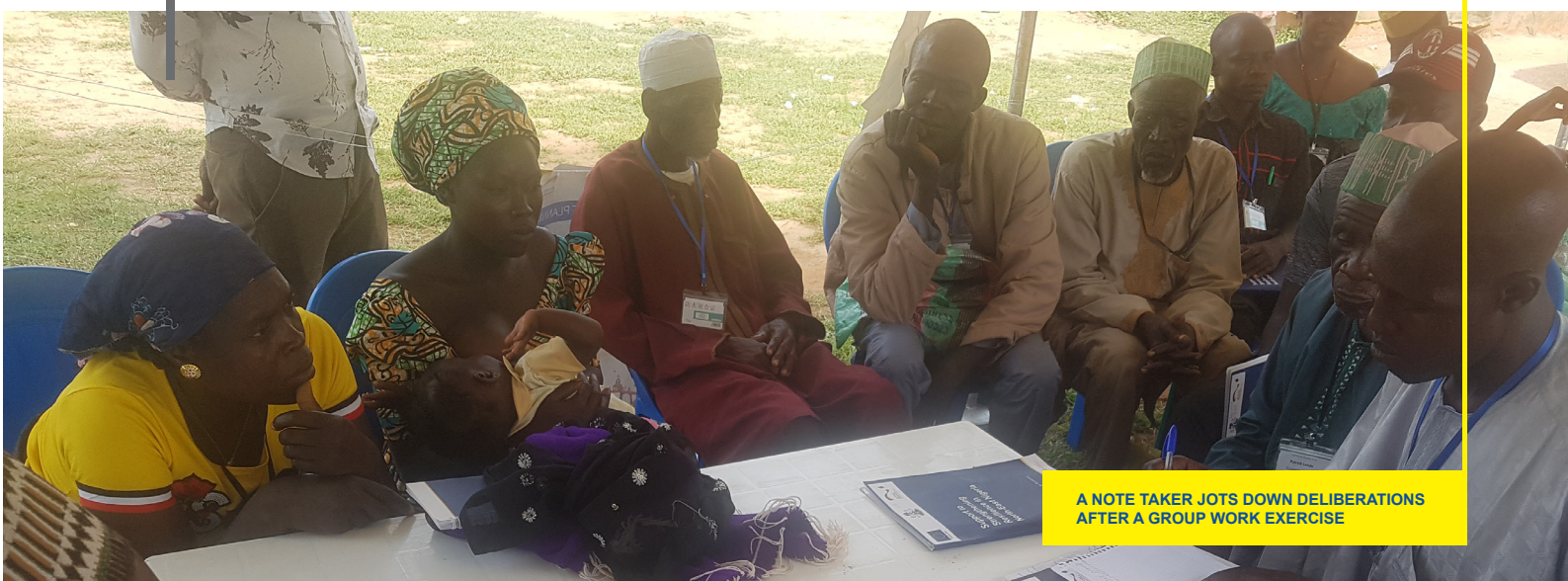
A NOTE TAKER JOTS DOWN DELIBERATIONS AFTER A GROUP WORK EXERCISE