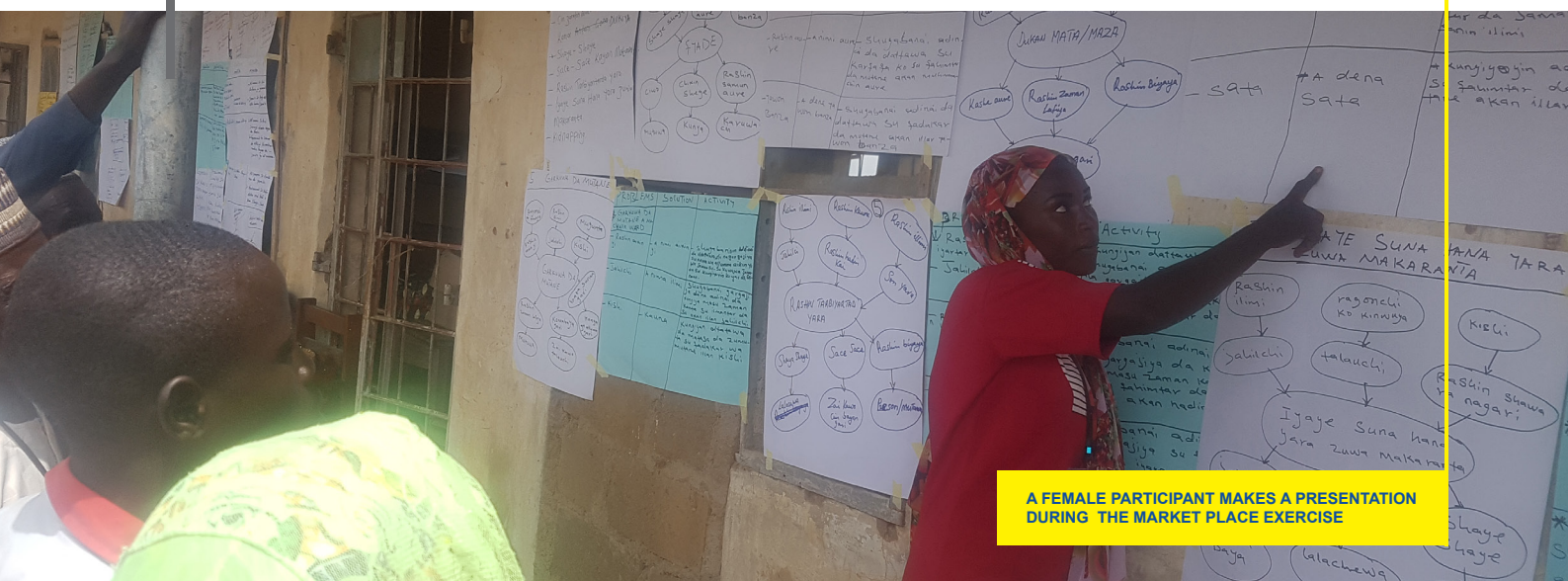
A FEMALE PARTICIPANT MAKES A PRESENTATION DURING THE MARKET PLACE EXERCISE