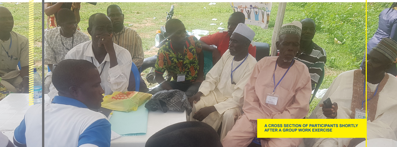
A CROSS SECTION OF PARTICIPANTS SHORTLY AFTER A GROUP WORK EXERCISE