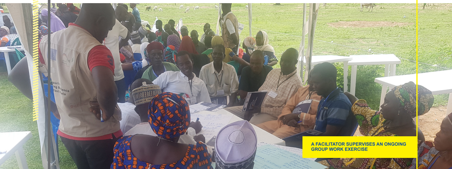
A FACILITATOR SUPERVISES AN ONGOING GROUP WORK EXERCISE