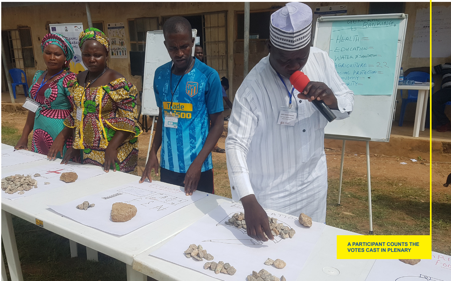
A PARTICIPANT COUNTS THE VOTES CAST IN PLENARY

To better understand our developmental needs, we Identified, discussed and prioritized the problems of our ward that need urgent attention based on sectorial clusters. The problems were ranked, first, based on gender and age group and then in plenary of the CDP session. Also, we sat together and analysed the causes of these problems. Out of the causes, we were able to identify possible solutions to the problems and proposed activities on how to tackle them.