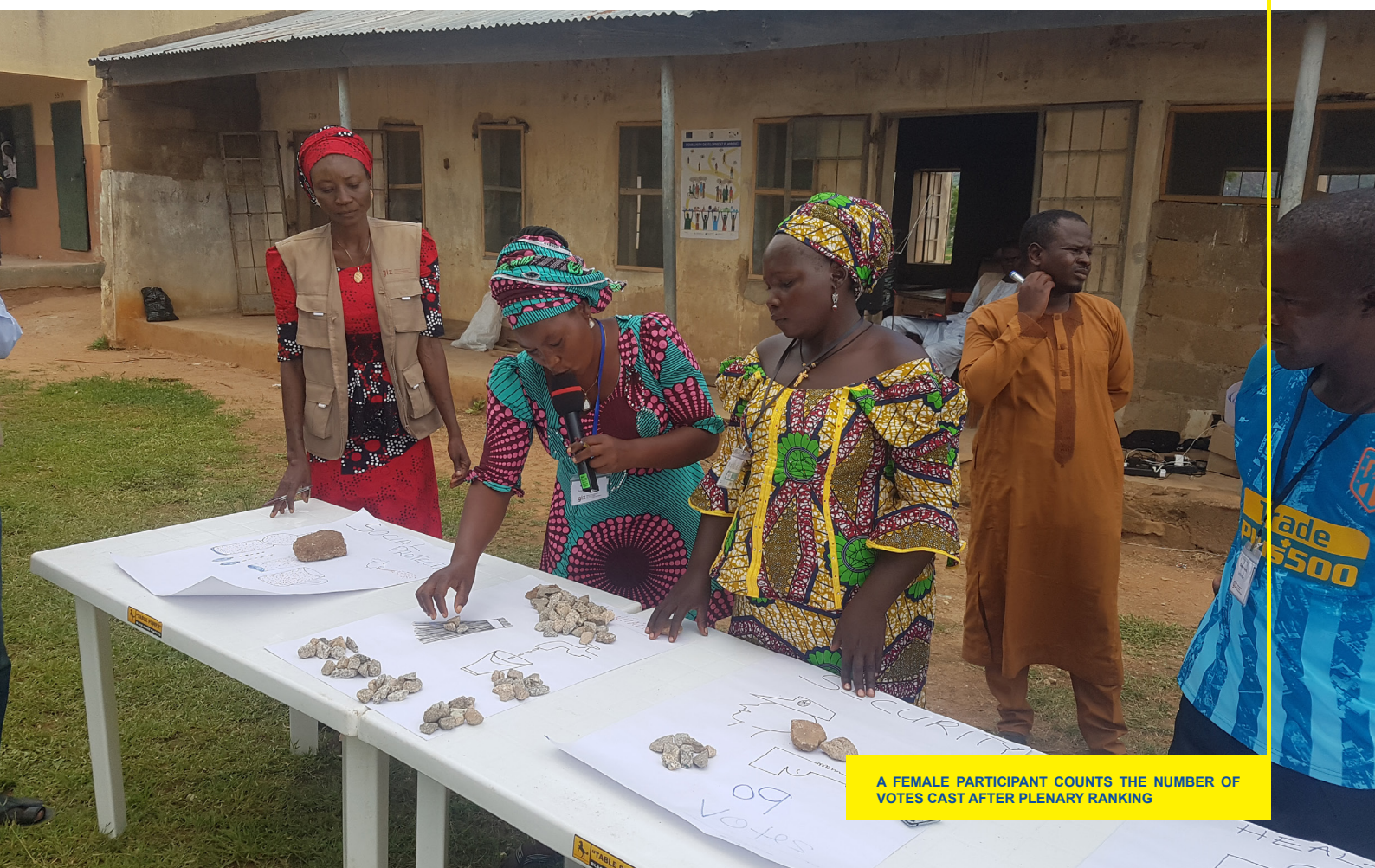
A FEMALE PARTICIPANT COUNTS THE NUMBER OF VOTES CAST AFTER PLENARY RANKING

In the tables below, you will find a summary of our discussions: