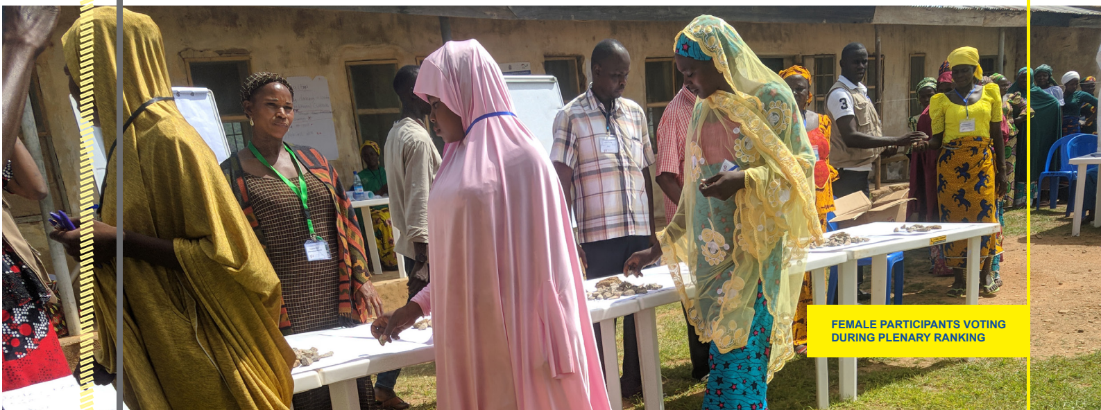
FEMALE PARTICIPANTS VOTING DURING PLENARY RANKING