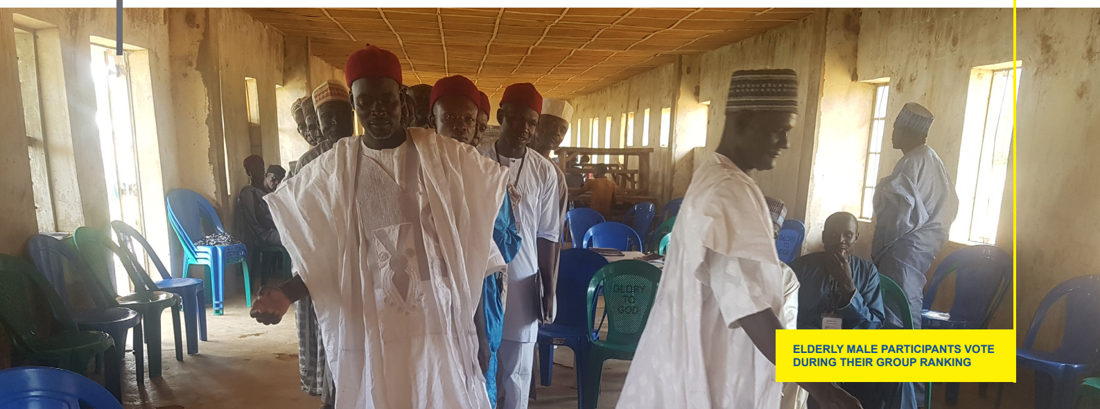
ELDERLY MALE PARTICIPANTS VOTE DURING THEIR GROUP RANKING