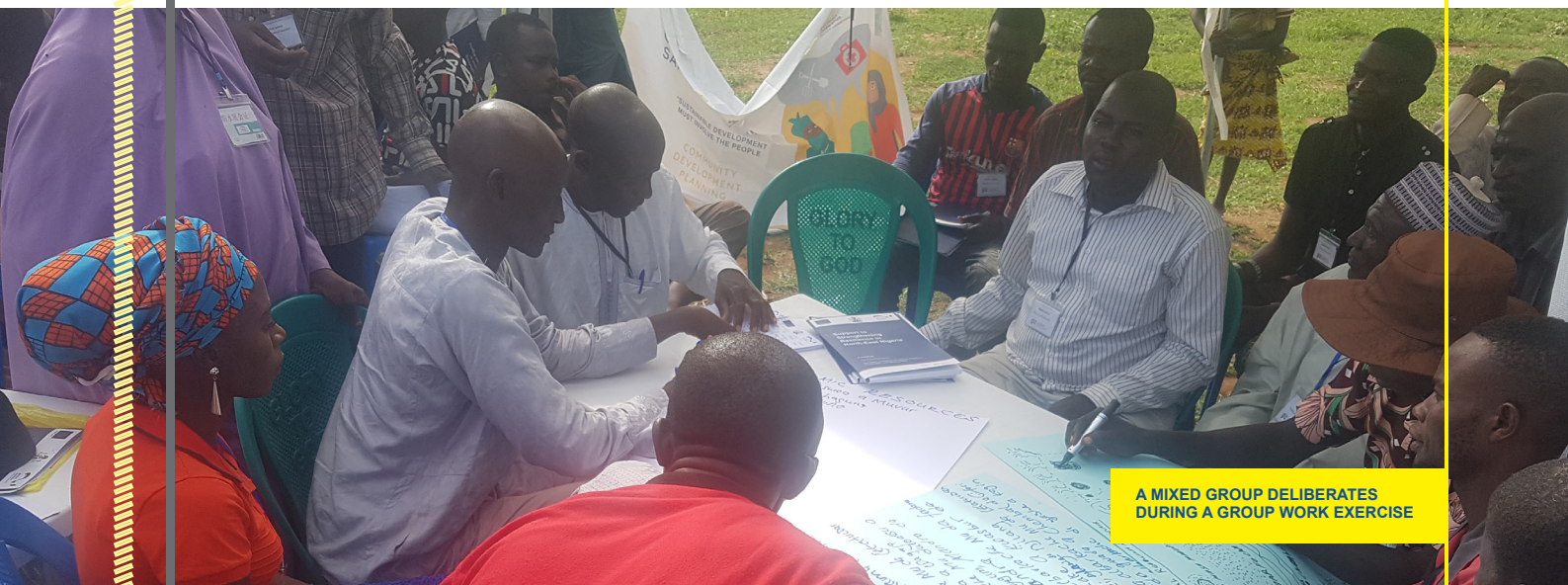
A MIXED GROUP DELIBERATES DURING A GROUP WORK EXERCISE